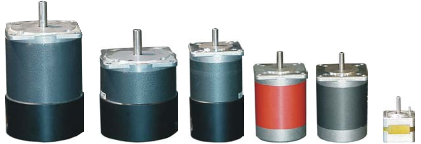
34-2A/I 34-1A/I 23-3A/I 23-3R 23-3H 17-SQ