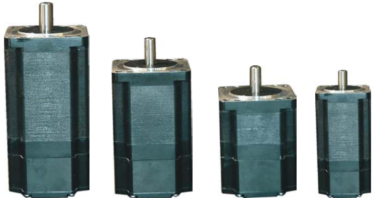
3913/RC 3910/RC 397/RC 368/RCI